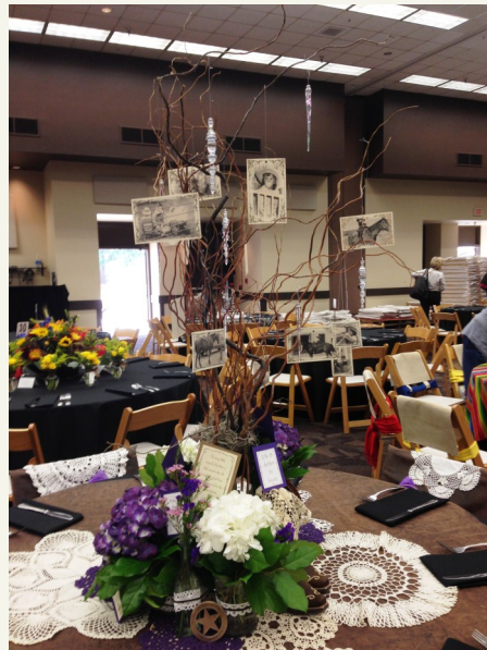
Cowgirl Hall of Fame 2014 Induction Luncheon— table sponsored by TCU RM

Please be sure to give us your name if it isn't clear from your email address.